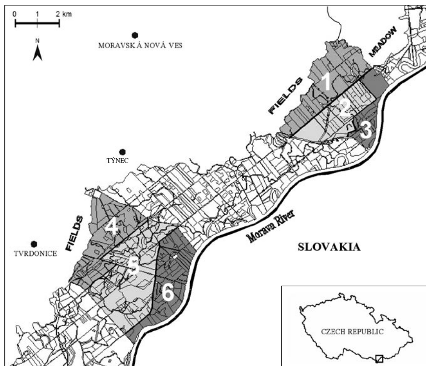
Fig. 1. Map of the studied forest with two subareas and six subplots (GIS map provided by The Forests of the Czech Republic, Forest Enterprise).

The study was carried out from 2001 to 2004 in floodplain forest on the bank of Morava River between villages Mikulčice and Tvrdonice (Czech Republic) (200–220 m above sea level). The study area (1 041 ha) was part of a larger forest complex, which forms a strip, one to three km wide and about 20 km long, along the Morava River (Fig. 1). It is a managed forest,